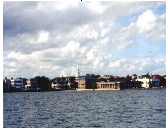
The fabled Battery

Stepping onto any street in peninsula Charleston presents a unique opportunity to be part of a living, breathing, vibrant interactive museum. Where too much of the past has been destroyed or paved over, Charleston reigns supreme with a critical eye for detail and rigid guidelines for historic preservation. A visitor is immediately drawn through a window to the past where architecture and magnificent gardens set heady standards. Forget your passports and the trip to Europe, history lives in Charleston, South Carolina.